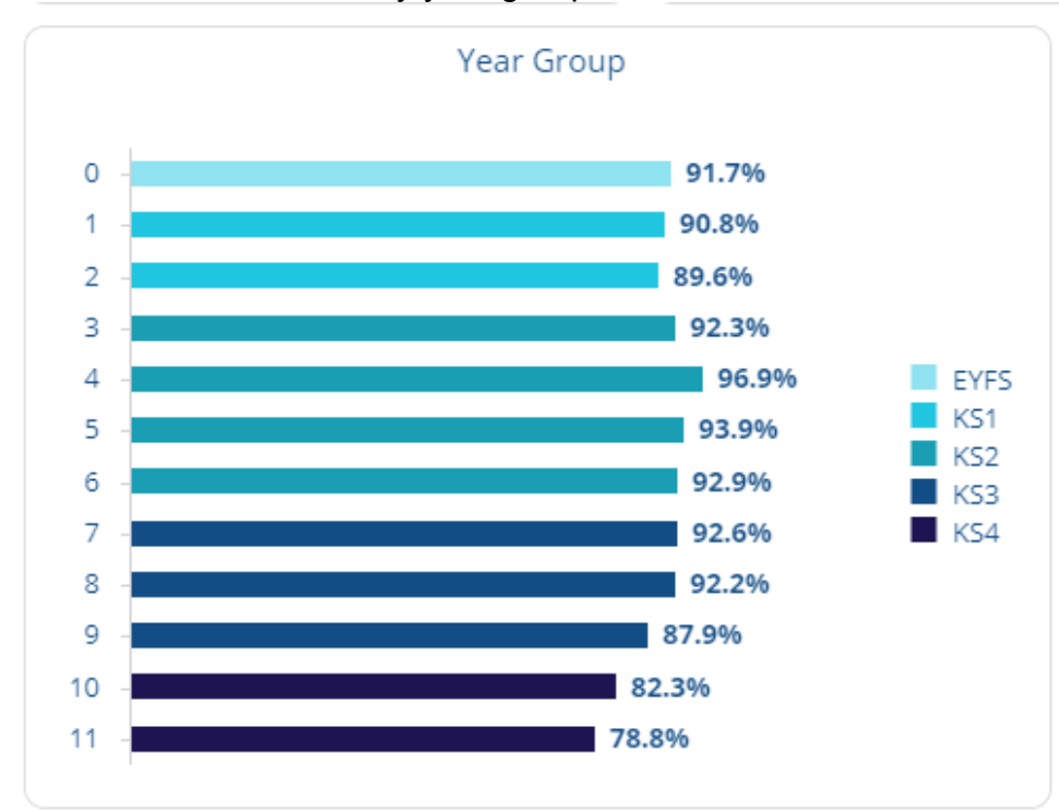
Table D4 – Attendance by year group for autumn 23